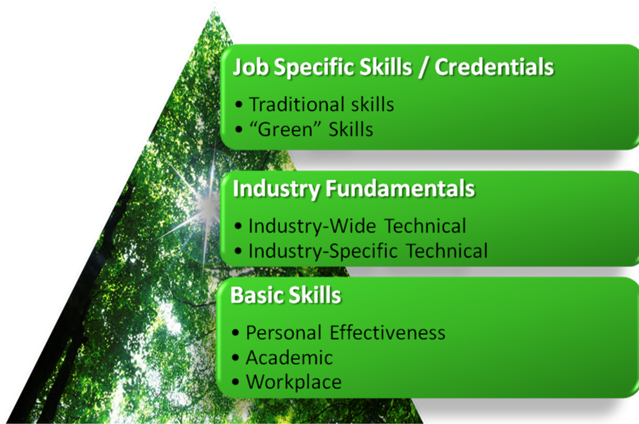
Energy Competency Model